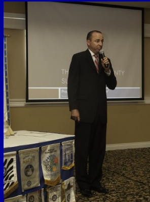
A proud father watches his son give an excellent presentation to ORC members and then presents him with the coveted box of Orange oranges.